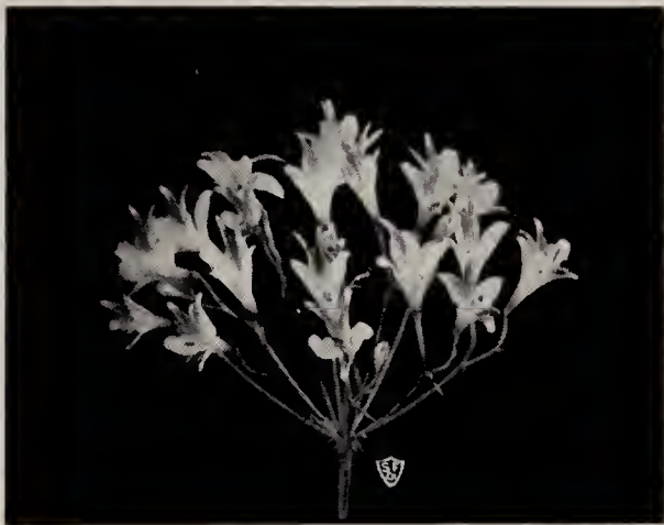
CHILEAN LILY. A very choice perennial for sunny locations requiring deep soil for its spreading fleshy roots. Its flowers in June and July are clusters of orchid-like blossoms ranging in colors from orange, salmon, pink, yellow and cream. Pot grown plants 50c each.

Many of our rare plants are not listed, however, as too few are on hand for that, but upon your inquiry they may be supplied. We offer only subjects that have proven their merit in our trials in Portland.